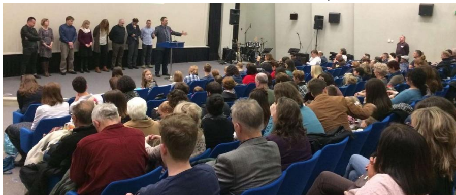
Prayer of pastors and leaders at joint service