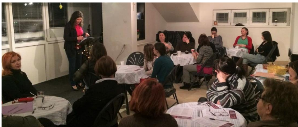
„Circle of Women“