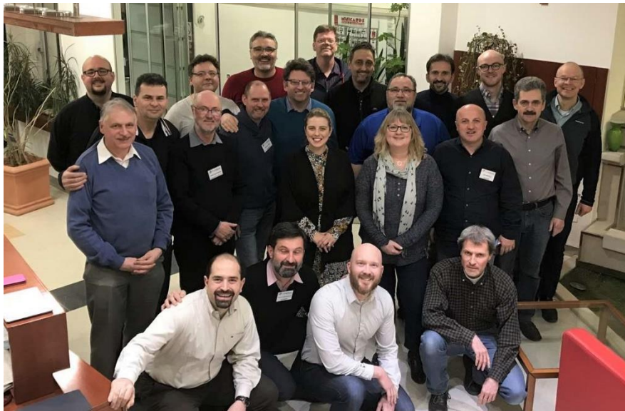
Langham European Consultations, Sarajevo