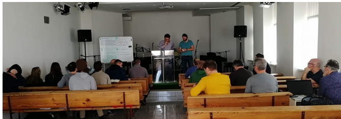
Langham in Slovenia

In February, after the Langham Preaching Seminar, Level 2, in Slovenia, I traveled to the Netherlands and Belgium where I gave evangelistic speeches at 3 universities. At the end of the month we had a meeting of the “My Brothers keeper” board at which we planned the June conference. We were happy that our wives joined us this time.