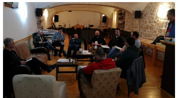
Langham in Šibenik, CRO

March also started normally, in the first week of March I spoke at the Langham Preaching Seminar, Level 3, in Šibenik, Croatia. In mid-March, I was supposed to speak at evangelistic events in the Czech Republic, then in Slovenia and at a meeting of the Protestant Evangelical Alliance in Belgrade, Serbia, but unfortunately all those planned events as well as those planned in the coming months were canceled due to the Covid-19 virus. Quite strict anti-virus measures were introduced in Bosnia & Herzegovina, which included curfew, ban on gatherings, closing of borders... We had to cancel all meetings in the church and all my planned trips were postponed.