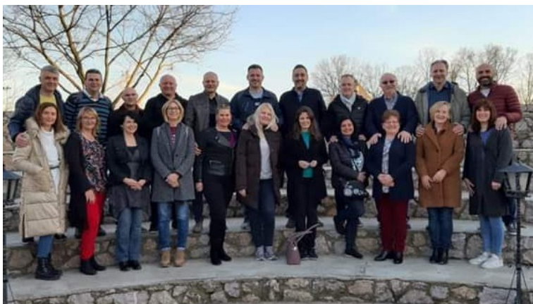
“My Brothers Keeper” board with wives