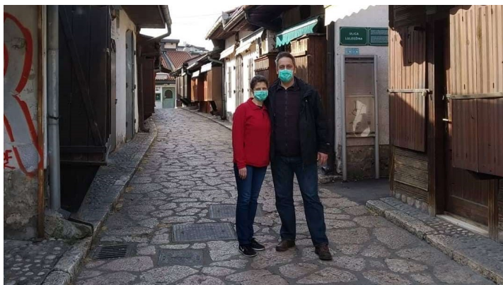
empty streets of Sarajevo