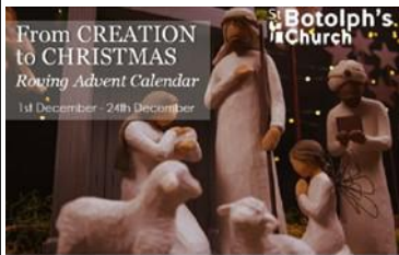
WE HOPE you enjoy following our Advent Window trail. The trail follows God's story from the creation of the world to Christmas, when God became man and lived among us. Each window will be unveiled at 6pm and will be lit each evening until at least 1st January 2021. There are a couple of days when two windows will share the same theme.

We are excited to launch our very first Advent Window Trail featuring windows decorated by members of our church family around Barton Seagrave and further afield. We know that Christmas is definitely not cancelled this year and we want to encourage our friends and neighbours with something that tells of the hope that Jesus brings, not just at Christmas but on every day throughout the year.