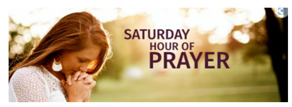
Saturday 20th August at 9.30am in Church House

Remember you'll get some brownie points with mum giving her a well earned break for a short time.